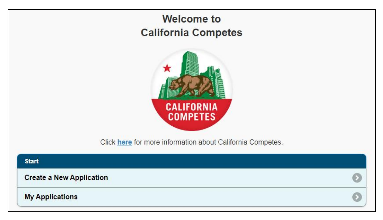
Figure 2: Home Screen

From the Create Application Page the applicant will be asked to provide basic information about the applicant. Please make sure that the "Applicant's Legal Name" is the official, legal business name of the applicant.