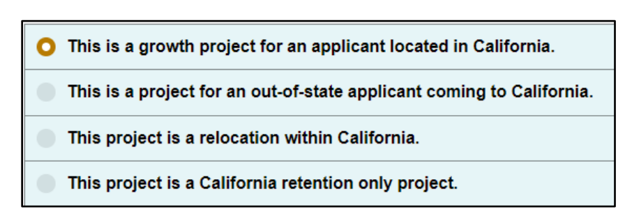
Figure 9: Description of the Project

Select the box that best fits the project. If the project has multiple components such as growth and in-state relocation, select one of the boxes and elaborate in the project summary section the details regarding the activities that will take place as part of both the growth and in-state relocation. The "retention only" box should only be checked if the applicant is not proposing any new full-time jobs over the 5-year period.