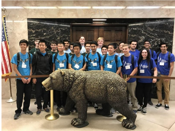
Pictured: Students from the California Cyber Innovation Challenge Day at the Capitol.