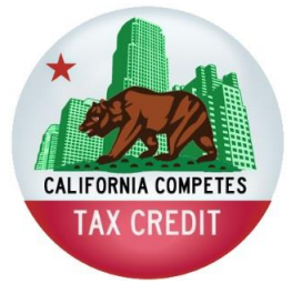
EXHIBIT B FIRST AMENDMENT TO AGREEMENT